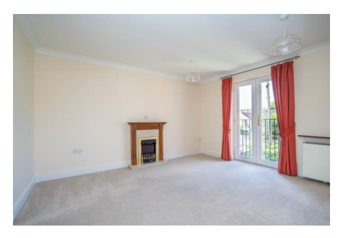
LIVING ROOM : 13'1 x 12'8 (3.99 x 3.86m) with Juliette balcony overlooking the communal gardens, electric coal effect fire with Adam style mantel and stone hearth, storage heater, secure entry telephone and door to separate kitchen.