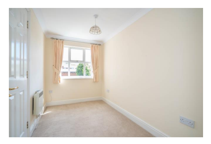
BEDROOM TWO : 10'9 x 6'5 (3.28 x 1.96m) electric wall heater, single cupboard.

SHOWER ROOM with large tiled and glazed shower cubicle with thermostatic control, pedestal basin, low level w.c., vinyl floor, tiled walls, extractor fan, wall heater, recess spot lighting, heated towel rail.